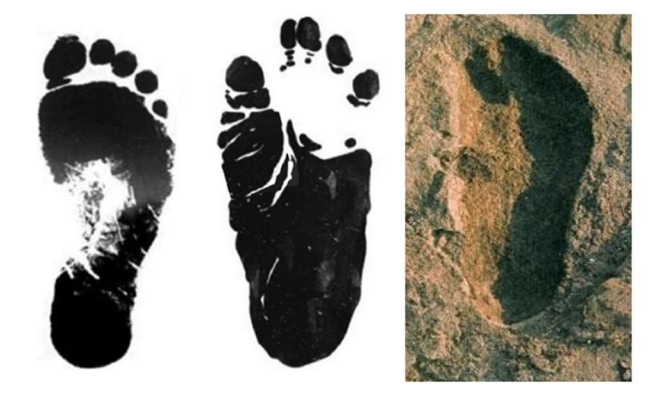
Figure 2. Footprints of (from left to right) Homo sapiens , Gorilla beringei (Eastern gorilla), and of extinct African hominid, possibly Australopithecus afarensis , at Laetoli 3.5–3.7 Ma [149]. Not to relative scale.

Moreover, it has been suggested that Ardipithecus and Orrorin were possibly better bipeds than the later australopithecines [8,32,73], which is not in contradiction with the possibility that these species were intermediate between a more orthograde ancestor and the knuckle-walking extant African apes. In fact, knuckle-walking may have developed in the late australopithecines instead of being initially present in the early australopithecines.