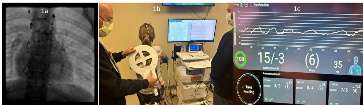
Figure 1. Interrogation of implanted hemodynamic monitor (CardioMEMs device) during exercise. (a) shows the fluoroscopic view of the IHM implanted in distal left pulmonary artery in patient 1. (b) shows the IHM device being interrogated on the same patient during CPET. The testing device is being held in a stable position in close contact with the patient near the implantation location. (c) shows the IHM recording of the same patient during exercise. Note there is good communication between the interrogation device and the sensor, as indicated by the displayed signal strength of 100% in the (1C-lower left corner). Negative pressures are noted during higher negative inspiratory pressures due to patient's breathing during exercise. The end-expiratory pressure (15 mmHg) represents the Fontan (mean PAP).

Patients performed exercise on an upright cycle ergometer using standardized ramp protocols with ramps set to achieve an exercise time of about 10 min. Electrocardiogram, blood pressure and oxygen saturation were measured continuously. Breath-by-breath metabolic data was obtained using a Vyaire Vyntus metabolic cart. IHM was interrogated using the hospital testing device. To assess orthostatic changes in Fontan pressures, we began with a supine measurement of mPAP to correlate with home measurements and then repeated a measurement when the patient was upright on the cycle ergometer. During active exercise, contact between the IHM and testing device was maintained consistently by an additional operator to ensure there is good signal strength for accurate measurements (Figure 1). During IHM recording, the monitor displayed negative pressures related to the negative inspiratory pressure. We confirmed with IHM technical team that the monitor erroneously labels the patient's respiratory rate during exercise as "heart rate" due to these negative inspiratory pressures (Figure 1c). Similar to cardiac catheterization with a free breathing patient, end-expiratory pressures were recorded as the Fontan pressure or mPAP. The attending physician supervised the CPET and interpreted the IHM mPAP during exercise.